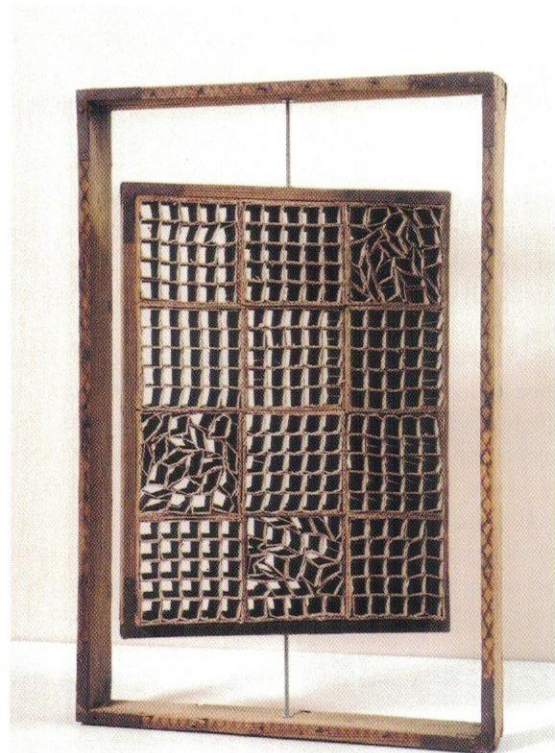
מסגרת עץ (אובייקט מצוי), מסגרת עץ נעה על ציר, ויטראז' מקרטון מוקשה, 20/120/84 wooden frame (found object), movable wooden frame, cardboard-vitrail